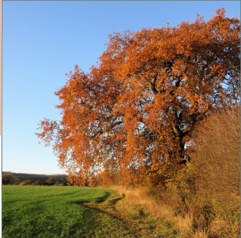
Oak tree on the Centenary Way (this one and front page (view to Idlicote) thanks to Penny F)

Here's a few (possibly) useful contact numbers: