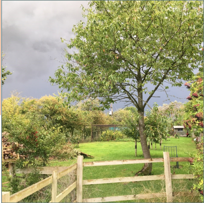
Pictures on pages 9 and 10 Liz and Penny, Snowy Village, Orchard and Deer Friends

Equally, if you would like a digital copy, do let me know—saves paper, ink...and walking!